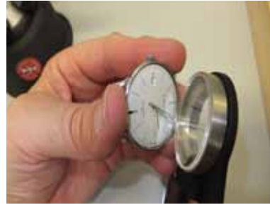
Step 10: Apply glass precisely to the inner edge of the case. Release the glass gripper and raise.