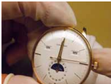
Step 12 A: Check that the spacer is seated correctly. The spacer should not be visible.