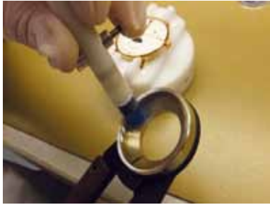
Step 8: Clean the reverse side of the glass prior to fitting.