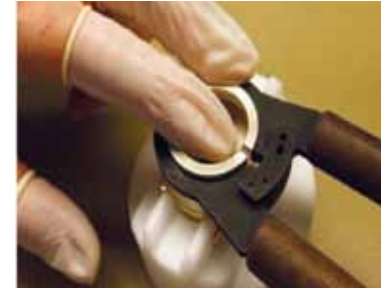
Step 11: Place the glass gripper onto the watch and release. When raising the gripper press downwards on the glass lightly with the finger to push it from the glass gripper.