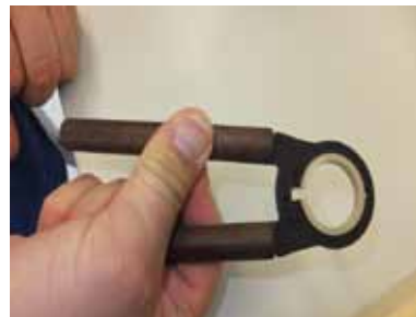
Step 14: Open glass gripper by pressing outwards and remove insert.