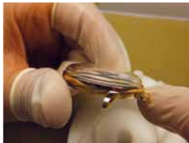
Step 13: Check that the glass is seated correctly.