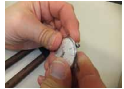
Step 12: Press on the glass gently to check that it is seated securely. The glass may click into place.